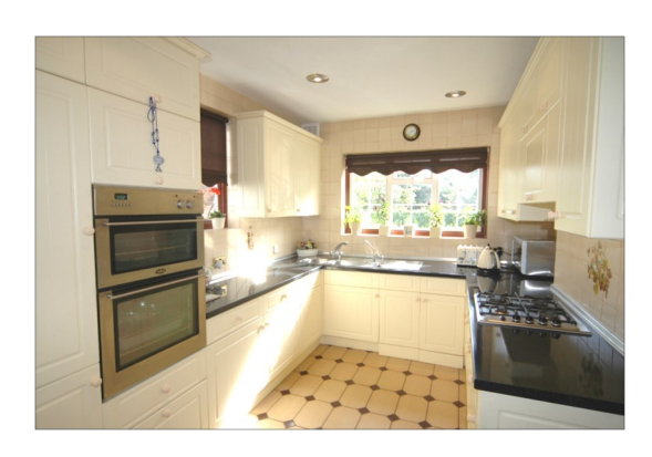
(Photographs taken previously) EPC = F Council tax band = H (subject to confirmation)