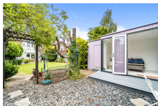
Grimshaw & Co