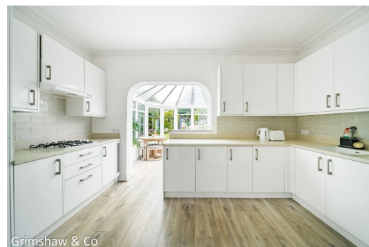
Grimshaw & Co