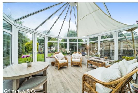
Grimshaw & Co