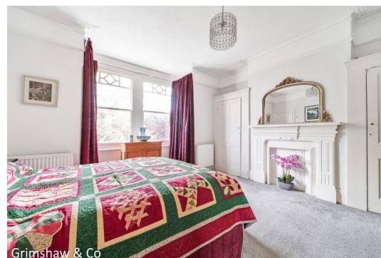
Grimshaw & Co