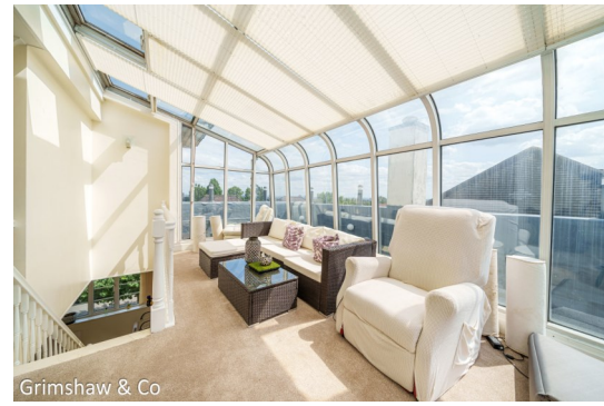
Grimshaw & Co