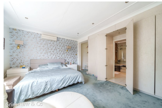
Grimshaw & Co