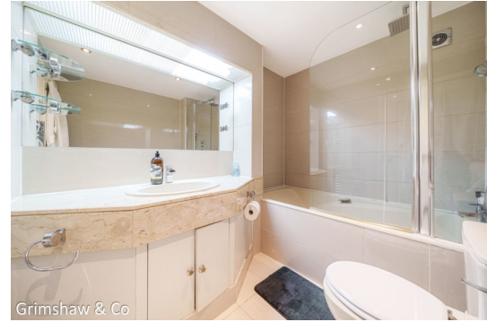
Grimshaw & Co