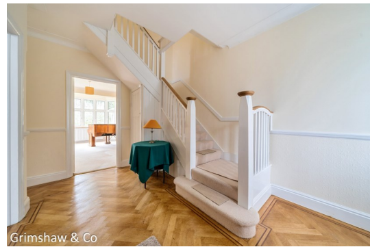
Grimshaw & Co