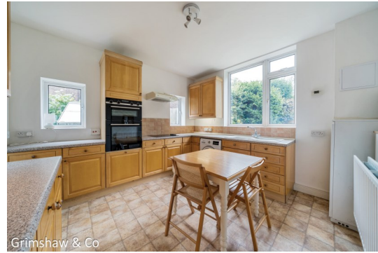
Grimshaw & Co